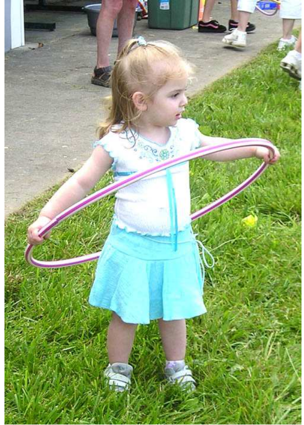
Queen of the hoola hoops!