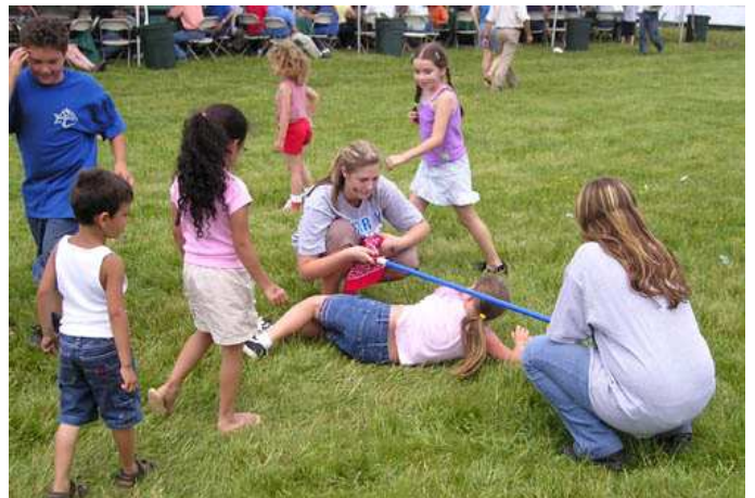
This girl will do anything to get under the limbo stick.