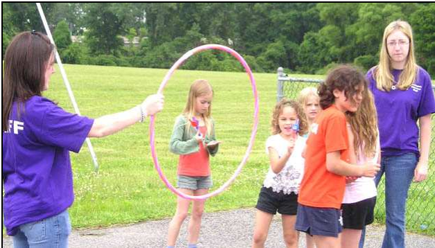
Okay, let's try to get the ball through the hoop!