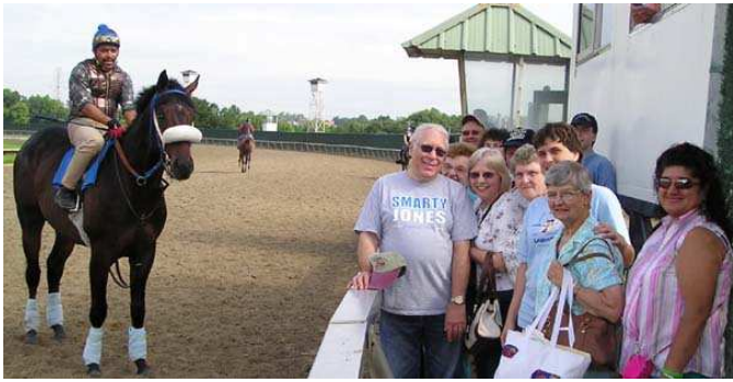
The Parkesburg Baptist Church tour group met the exercise rider and his horse.