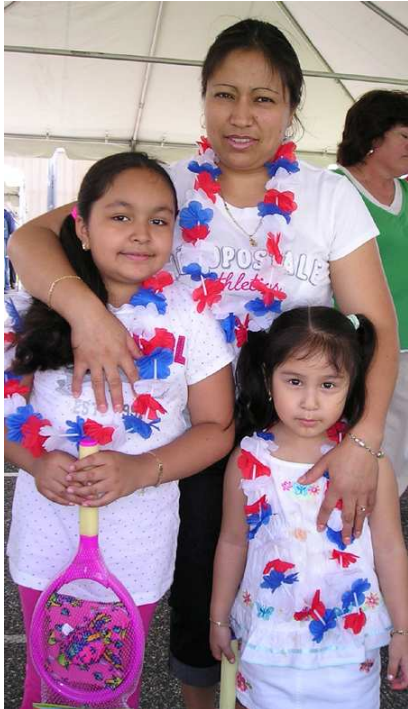
Mom and daughters enjoyed receiving the leis, racket and ball and Frisbees.

Independence Day Party 2009 ABWMOPAD Annual Conference Parkesburg Baptist Church Tours the Racetrack God Things at the Track Youmans Fund Helps Stable Employee 2009 Christmas Party Gift Form Website Totally Redesigned