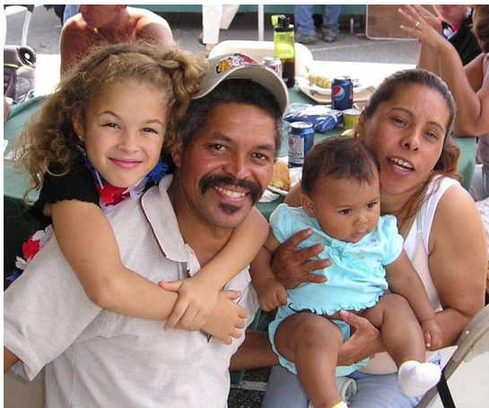
We all enjoyed a beautiful day of family fun.