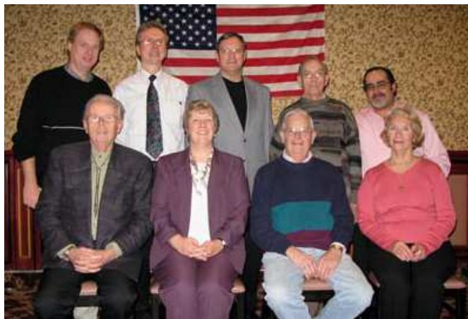
Council Members of RTCA, PA Division, Inc.