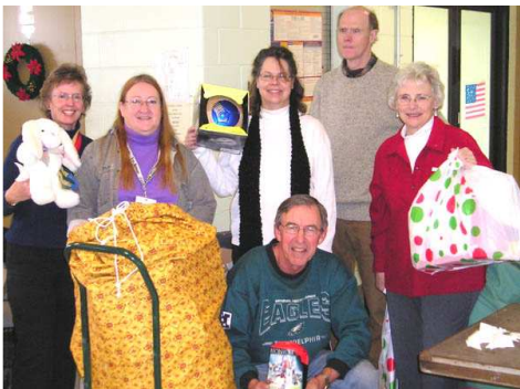
Volunteers from Swarthmore United Methodist Church were Santa's helpers for wrapping gifts for the children.

Christmas Party 2008 "Heroes of the Track" Award New Support Staff Chapel 'n Chow Nights Ethel's Corner God Things at the Track