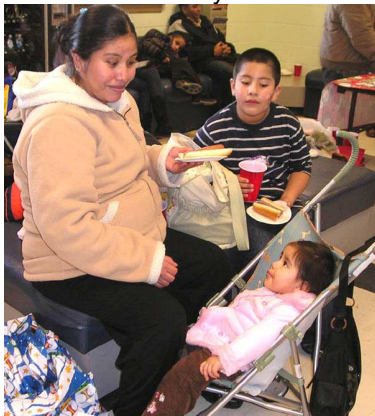
Mom and children enjoying the meal