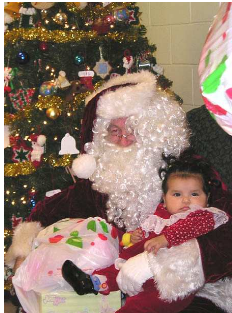
Santa met a new friend at the Christmas party.